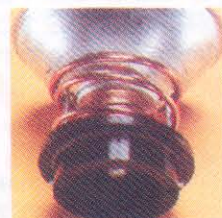
When bulb breaks spring expands to disconnect broken bulb from battery.