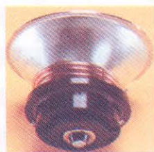
Assembly shown ready for use with spring compressed.

All Fulton flashlights are black with yellow fittings, as called out by U.S. government specifications.